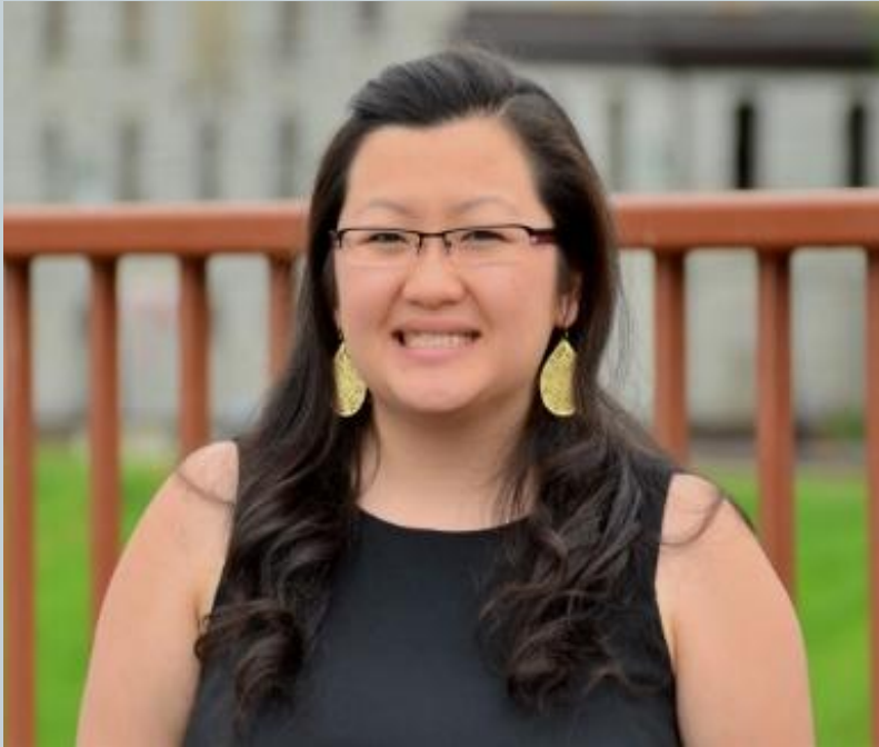
Say Yang Hennepin County